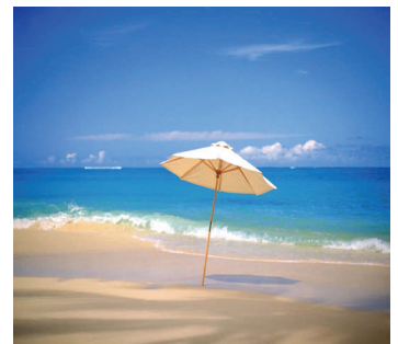
Why are Scots paying more for their holidays?

210,00 charter passengers to Manchester airport, which represents a huge loss to the Scottish economy. It is quite right for people to make the best use of their money and organise their holidays in order to get best value for their families, but shocking that in order to do so they must incur additional journey times to distant airports because airlines impose such high costs on flights out of Glasgow."